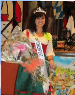
Miss Oktoberfest 2015

Tapping of the Keg German Draught Beer Delicious German Food Miss Oktoberfest Contest Live Music by