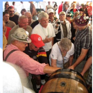
"Munich in Hamilton"

Alpen Trio 3-6pm The Nu-Tones Band 7:30 - midnight